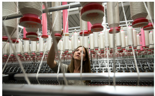
Spinning process at Varvaressos

For 4 generations, Varvaressos has taken care of its territory, meeting the economic needs and increasing the productivity of local farmers and businesses. Indeed, the whole supply chain is located within 200 km by the company. To prove such commitment, the company has equipped the SUPREME GREEN COTTON® collection with a QR code providing detailed information about all the production phases, making the products 100% traceable.